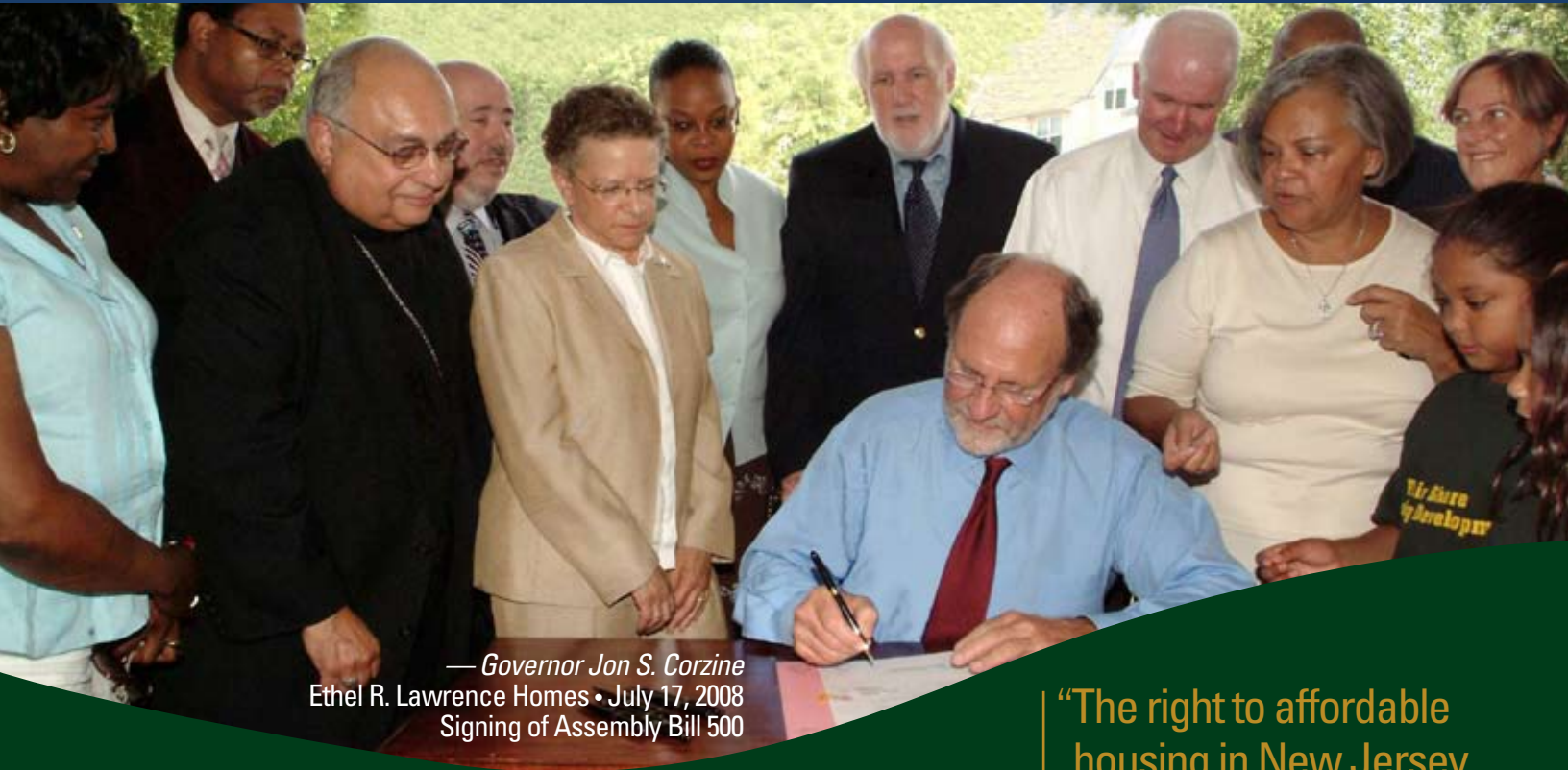
— Governor Jon S. Corzine Ethel R. Lawrence Homes • July 17, 2008 Signing of Assembly Bill 500

“The right to affordable housing in New Jersey is just that: It’s a right. ”